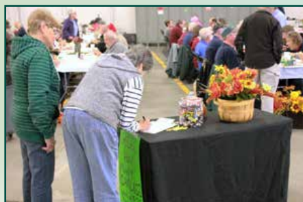
Members enjoyed several games during the picnic.

Interactive displays provided a learning experience in energy efficiency.