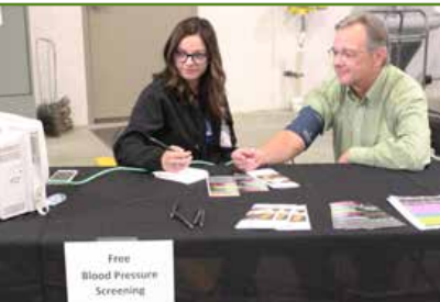
Vernon Memorial Healthcare provided free blood pressure screenings.

Thanks to everyone who stopped by our office in Westby to help us celebrate National Co-op Month. The cooperative business model puts service first and highlights how working together can get us the things we need at an affordable price.