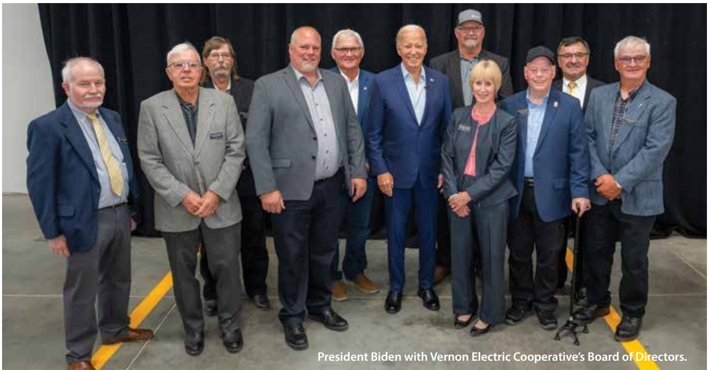
President Biden with Vernon Electric Cooperative’s Board of Directors.

Note: Vernon Electric Cooperative has hosted elected officials from all political parties. However, Vernon Electric is not a partisan organization and does not endorse individuals or elected officials.