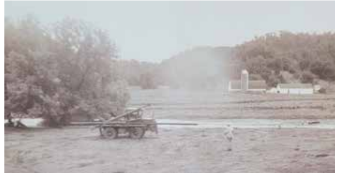
A look back: Many VEC's founding members were dairy farmers who came together in the 1930s to bring reliable and affordable electricity to rural Wisconsin.

Dairy farming and electricity have always been intertwined. Reliable power keeps milking parlors running, coolers chilled, and barns lit to accommodate farmers' long days. We are proud to support our dairy members with dependable service and programs that help manage energy use and keep costs affordable. From load management options like our Peak Alert program to energy efficiency rebates for