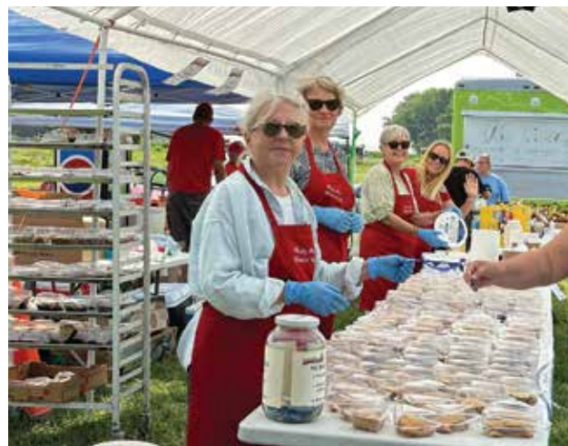
Local volunteers bake homemade pies prior to the event.

Speaking of pie—there will be plenty of it. Local volunteers bake 70 to 75 homemade pies in the days leading up to the event. "The strawberry rhubarb has become the signature pie," said