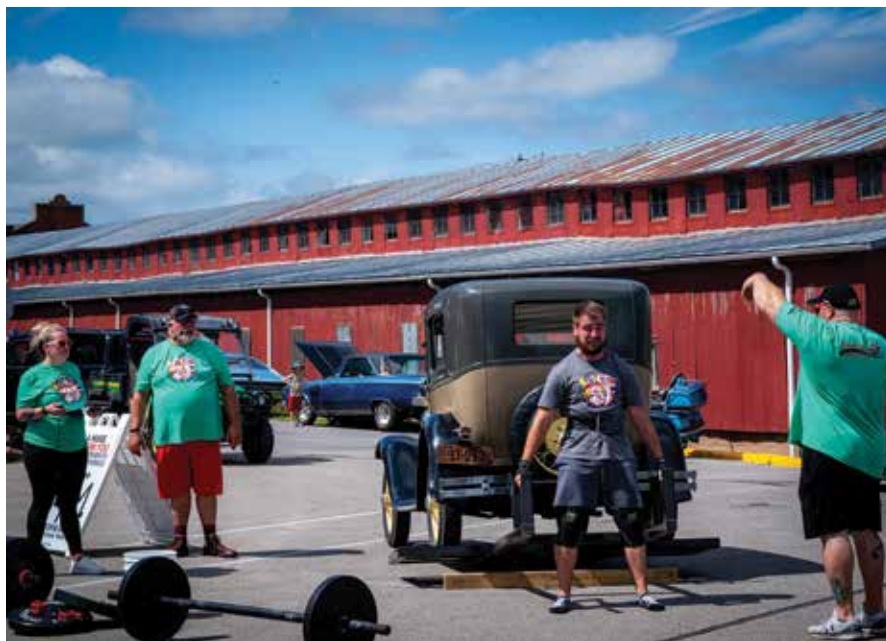
The Strongman competition features automotive-themed feats of strength, including lifting engines and pulling full-sized vehicles.