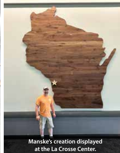
Manske’s creation displayed at the La Crosse Center.